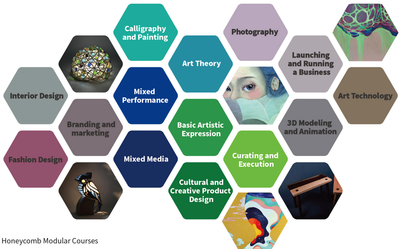
Honeycomb Modular Courses

Each student is free to take different course modules, resulting in their own unique program of study.