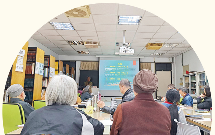
Seminar of students

To intensify exchange and interaction between students preparing their master theses and PhD theses, the Graduate Institute of Asian Humanities (GIAH) organizes reading groups and colloquia related to the topic of their theses.