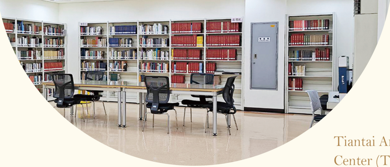
Tiantai Archive Center (TAC)